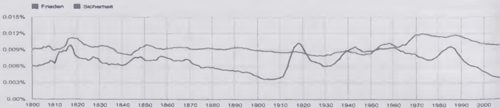
Source: Google ngram viewer. 33